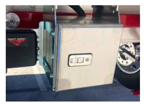
• Stainless steel lockable control box