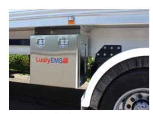
Stainless steel toolboxes