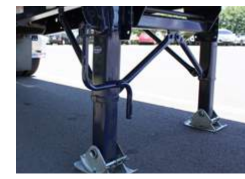
• Compensating or rocker landing feet