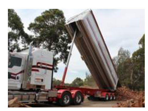
Choice of hoist