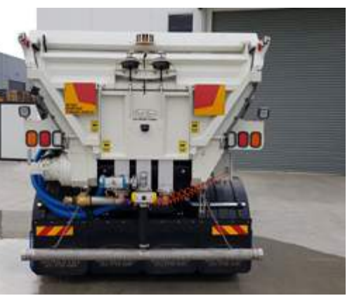
• Removable Water Tank with sprayers