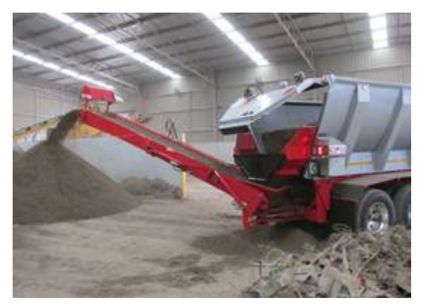
• 6m Rear Conveyor

Pivoting Side Conveyor Extends from 1.5m to 3m past the RH side of the body