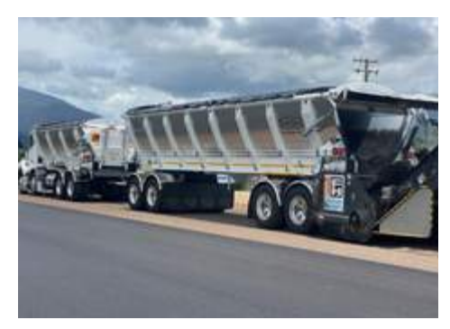
• 3 & 4 axle dog trailer configurations via PBS