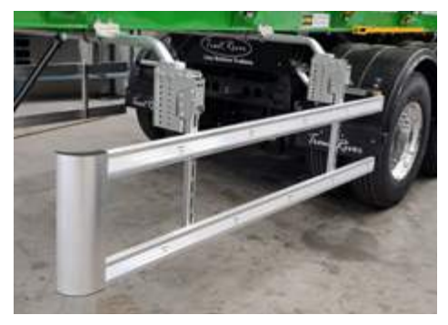
• Side underrun protection