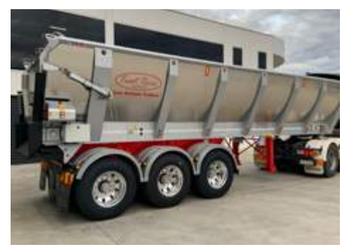
Insulated side walls