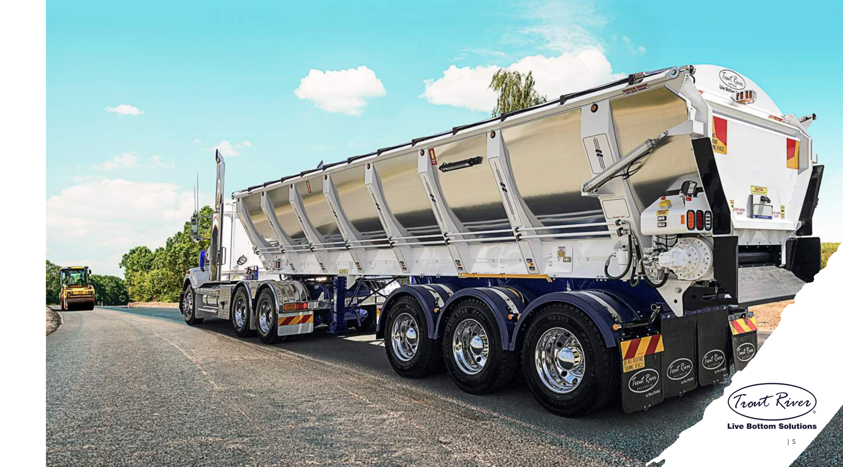
Warranty Refer to full T&C's of sale