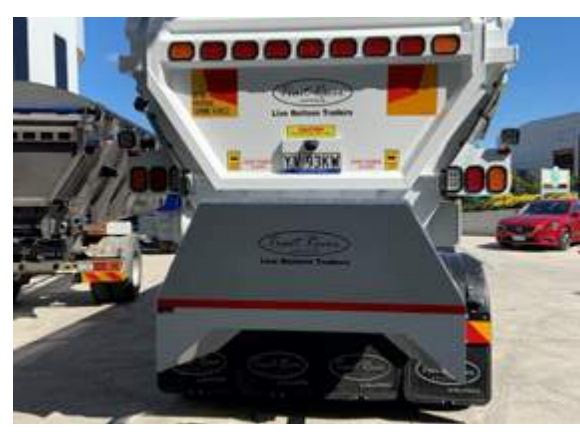
• Rear Diffuser

Contact your Trout River Dealer to discuss which attachment is ideal for your particular use.