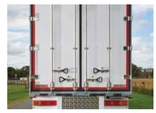
Stainless steel external lock-rod door hardware