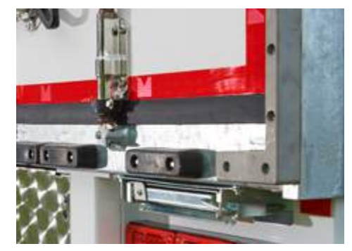
Stainless steel rear corner castings