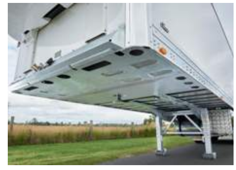
Full length chassis