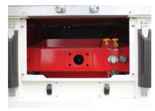
Road train provision or coupling