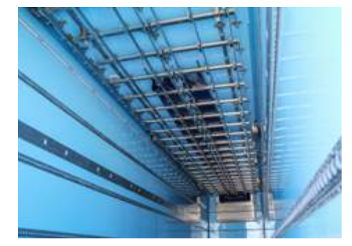
Meat hanger configuration