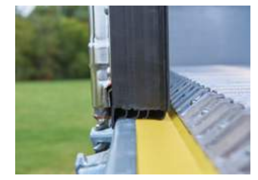
Fully-moulded door seal