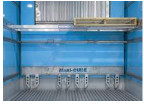
Horizontal double loader system