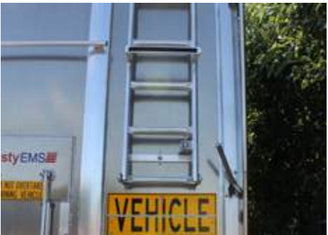
• Access Ladder