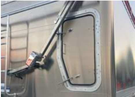
• Access door