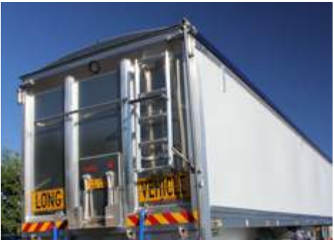
• One way externally hinged tailgate