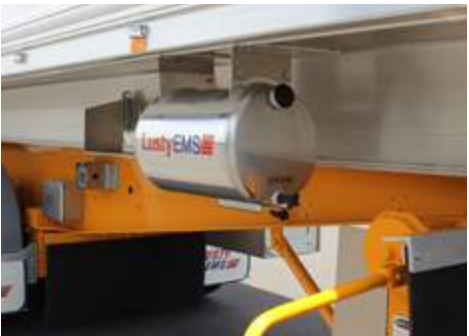
• Water tank