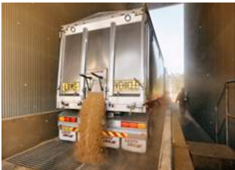
• Grain door with nylon slides