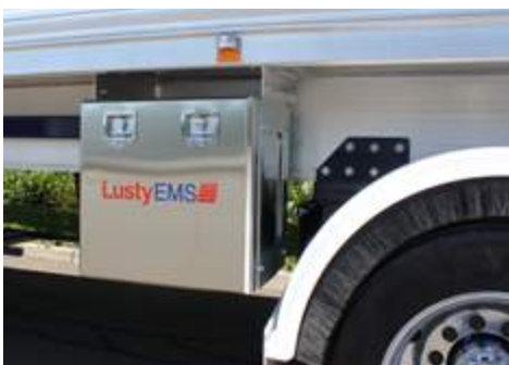
• Stainless steel toolboxes