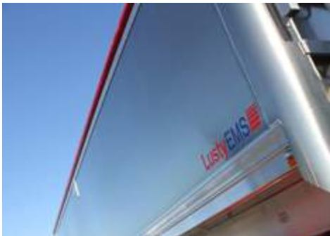
• Lightweight aluminium body construction