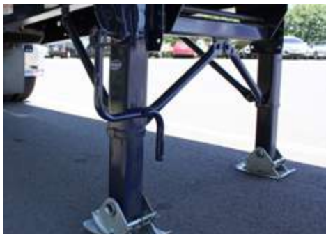
• Compensating or rocker landing feet