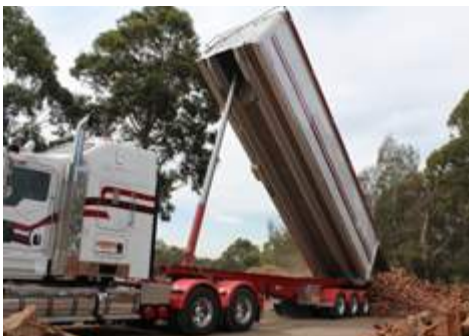
• Choice of hoist