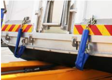
• Tailgate spreader chains