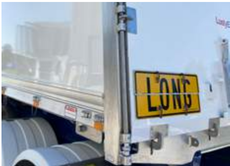
Air operated grain locks