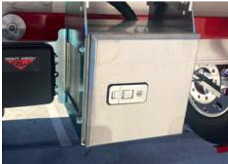
• Stainless steel lockable control box